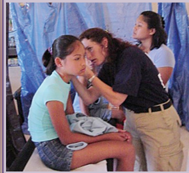
Figure 6 Member of Boston disaster team examines a child in Guam.

known as “Ground Zero” (Figures 4 and 5). Within these 5 stations, medical personnel treated more than 500 patients each day. The posts operated around the clock. The ailments experienced by the rescue workers