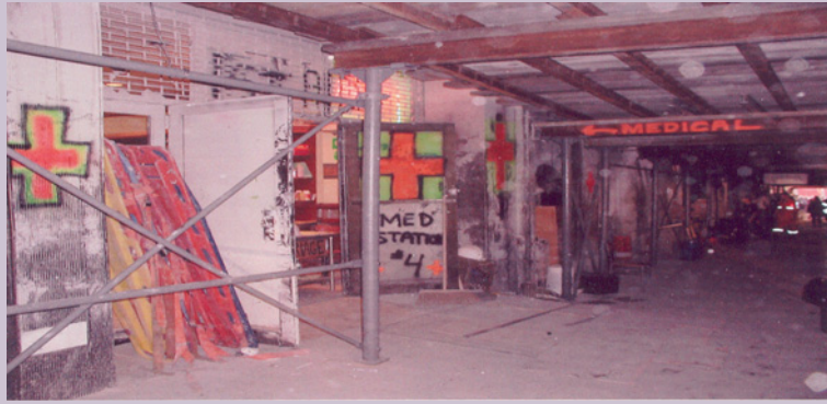
Figure 4 Medical station at “Ground Zero.”