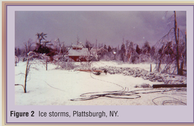
Figure 2 Ice storms, Plattsburgh, NY.

A typical mission could include replacing the actual local hospital with a DRASH or providing an inter-