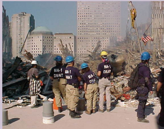
Figure 5 Some members of the Boston disaster team at “Ground Zero.”

known as “Ground Zero” (Figures 4 and 5). Within these 5 stations, medical personnel treated more than 500 patients each day. The posts operated around the clock. The ailments experienced by the rescue workers