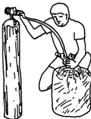
g. introduce oxygen 2/3 local volume of bag