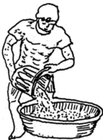
d. transfered harvested basins