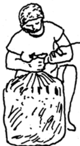
h.fashen upper end of bag with rubber band