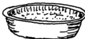
e: made the head count then distributed in other plastic basins: density compared by ocular inspection low water temp. 24°C