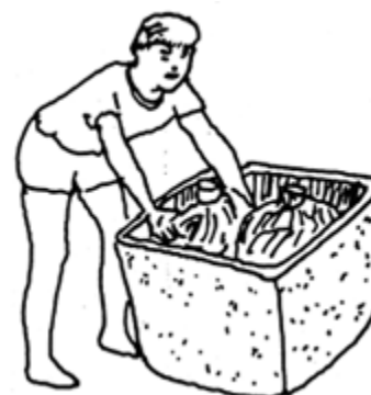
i. place bags in styrofoam boxes