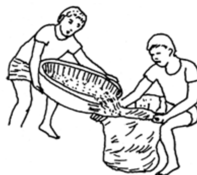
f: place known amount of larvae in plastic bag